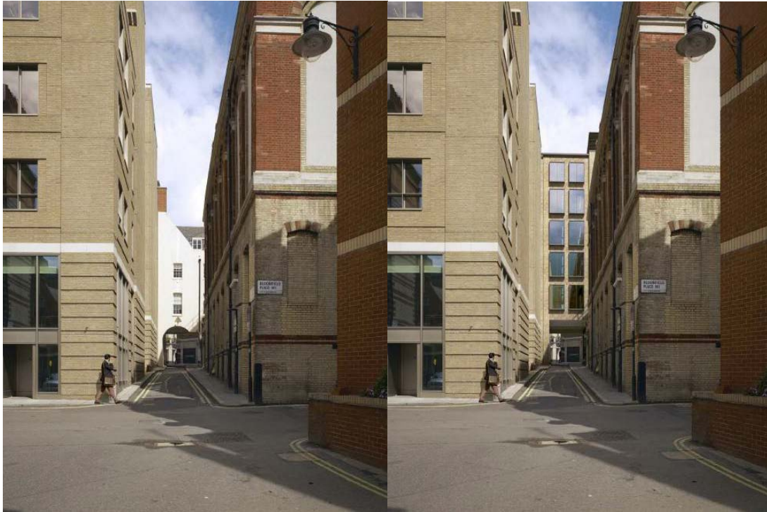
Existing and proposed view from Bourdon Street at junction with Grosvenor Hill