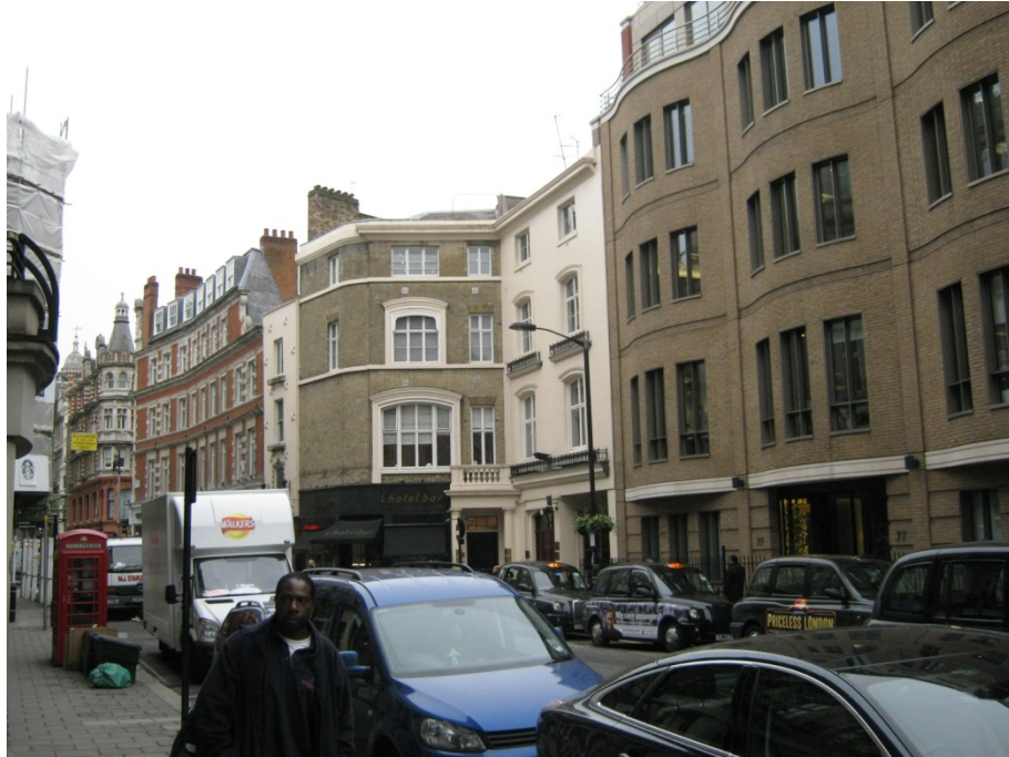
View to the rear on Bourdon Street