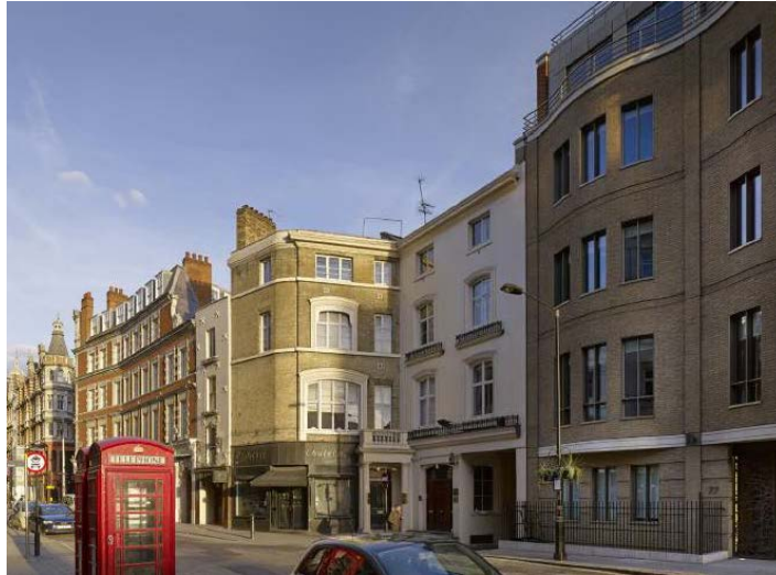
Visual of existing building as seen from Grosvenor Street.