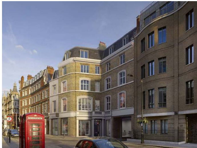
Visual of proposed building as seen from Grosvenor Street.