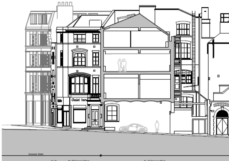
Existing section through building.