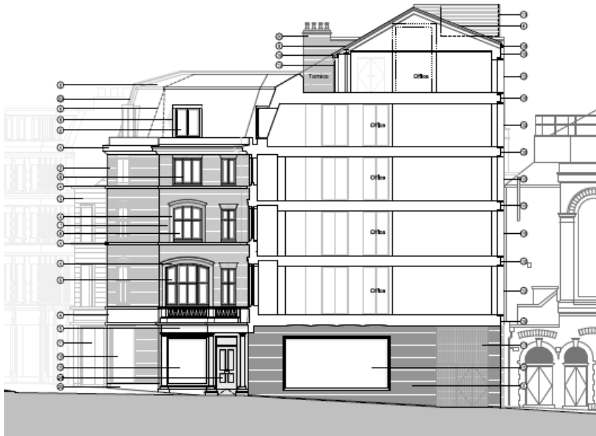
Proposed section through building.